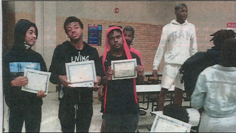
Al Raby students take a break from their pizza party celebration to display their Too Good For Drugs Certificates.