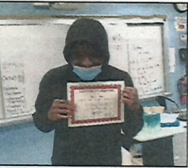
CCA Academy students show off their Too Good For Drugs Certificates during their pizza party celebration.