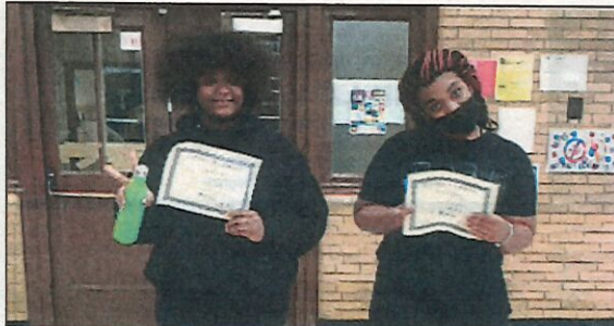
Al Raby students take a break from their pizza party celebration to display their Too Good For Drugs Certificates.

Strengthening Community Resilience - Substance Misuse & Overdose Prevention